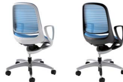
Frame Color : White