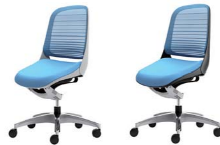
Frame Color : White